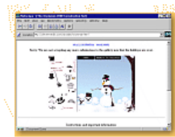
The Snowman 2000 Construction Set