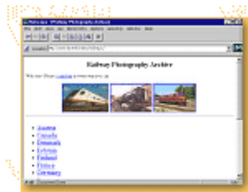
Railway Photography Archive

Anna's challenge result : Find yourself a job with the Net